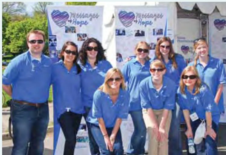
Solvay Pharmaceuticals, Inc. "Message of Hope" Wall

It was an unforgettable day and everyone that came left with more knowledge about PD and an incredible sense of belonging. ☺