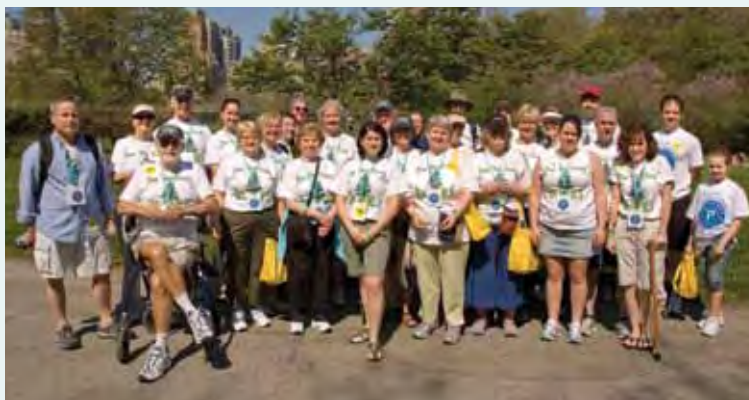
Pine Tree State Parkies Team

Start Your Fundraising Now! The 16th Parkinson's Unity Walk Community & Education Day — April 2010