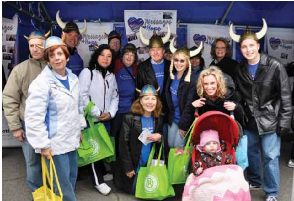
Team "William the Conqueror" at Abbott's Messages of Hope™ Wall

Thousands of participants came out to the 17th Parkinson's Unity Walk on Saturday, April 16, in New York City's Central Park to help raise funds and awareness for Parkinson's disease (PD) research, exuding commitment, support and high energy, in spite of an unseasonably cold spring day. This year's Unity Walk included teams from around the globe and comprised the largest grassroots initiative in the U.S. for Parkinson's disease research.